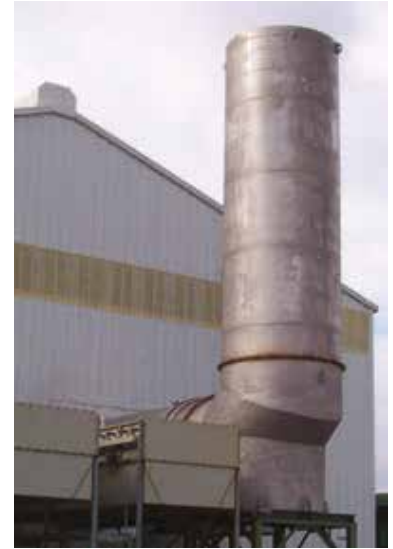
Custom designed to specifications